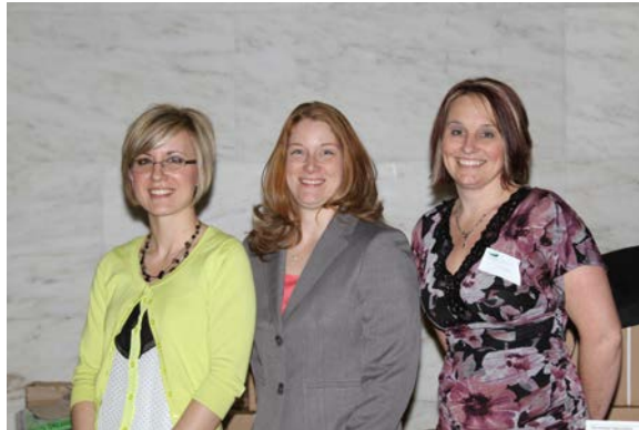
Members of Wyoming County EDA's friendly staff are on hand to answer any questions you may have.

For questions about this loan, or other opportunities available through the WCEDA, call (304) 732-6707.