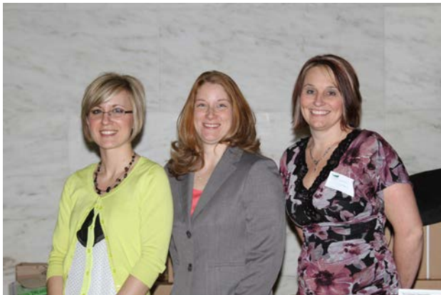
Members of Wyoming County EDA's friendly staff are on hand to answer any questions you may have.