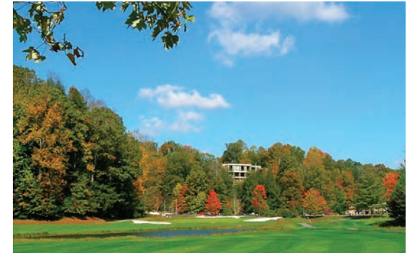
The Wyoming County EDA is located in Pineville, WV—right in the heart of beautiful southern West Virginia.